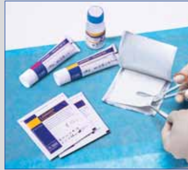
Can also be additionally moistened with LAVANID® wound gel (with dry wounds)