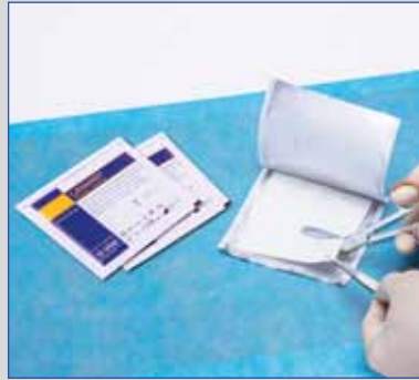
Can be easily cut, draped or used as a tampon for packing the wound