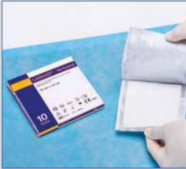
Ready-to-use moist dressing for direct application on the wound